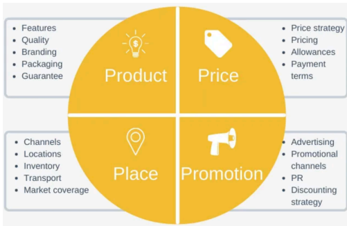
Figure 6: 4Ps of Marketing