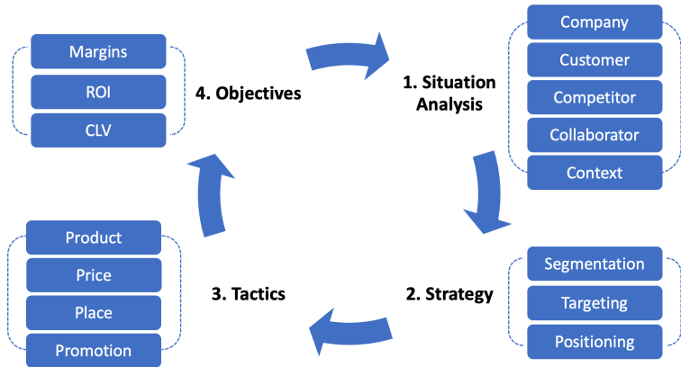
Figure 1: Marketing Process