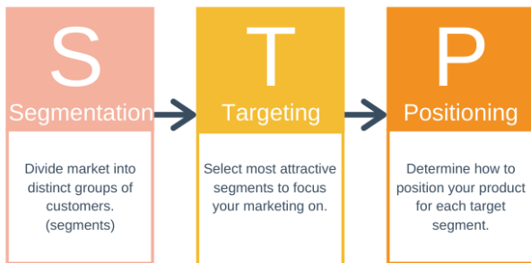
Figure 5: Segmentation, Targeting, and Positioning