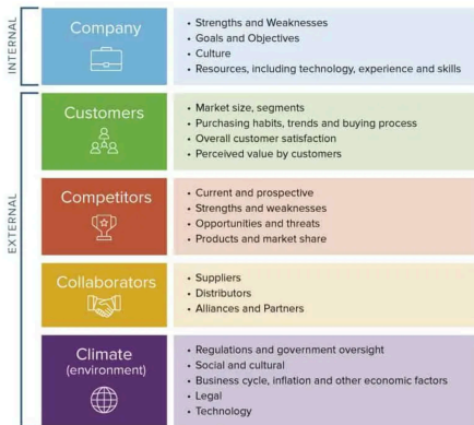
Figure 2: 5Cs of Marketing